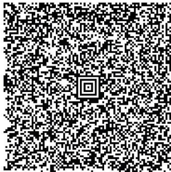
EZConfig installation barcode